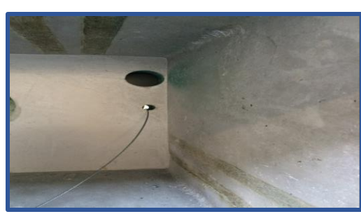
AIS 041 Cyclone Main Chamber View showing optional winch assembly