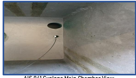
AIS 041 Cyclone Main Chamber View showing optional winch assembly